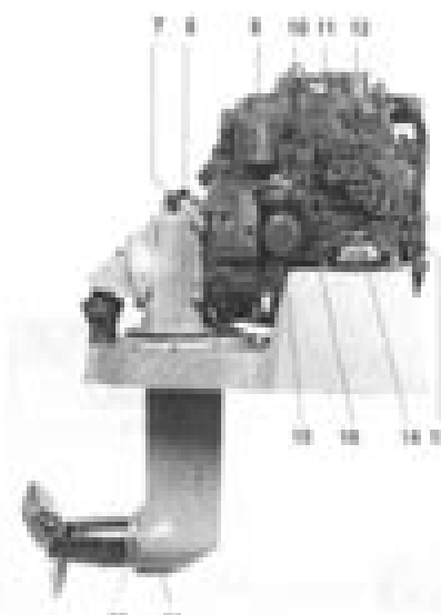
MD2010AB & MD20