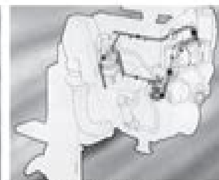
The fresh water cooling system, thermostat open