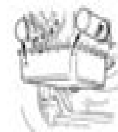
The location of the mandibular foramen is shown in the diagram.