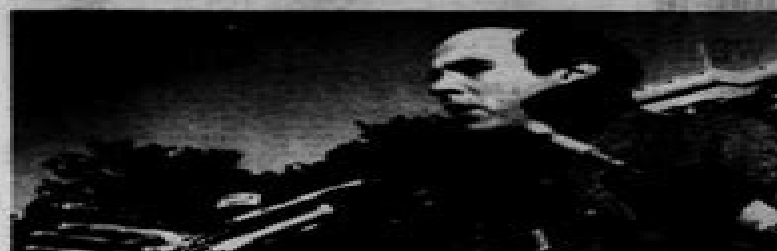
Addressing Protesting Farmers