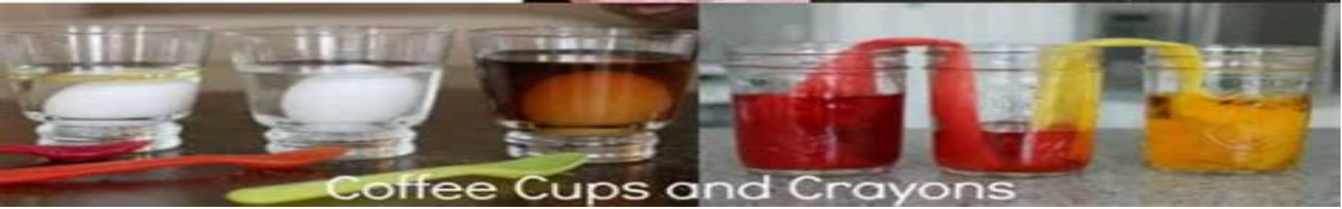
Coffee Cups and Crayons