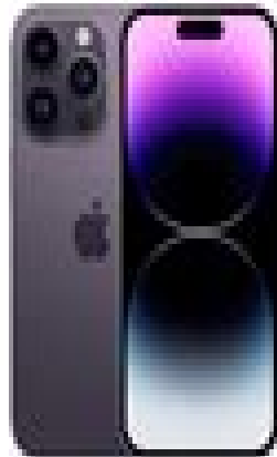
iPhone 14 Pro