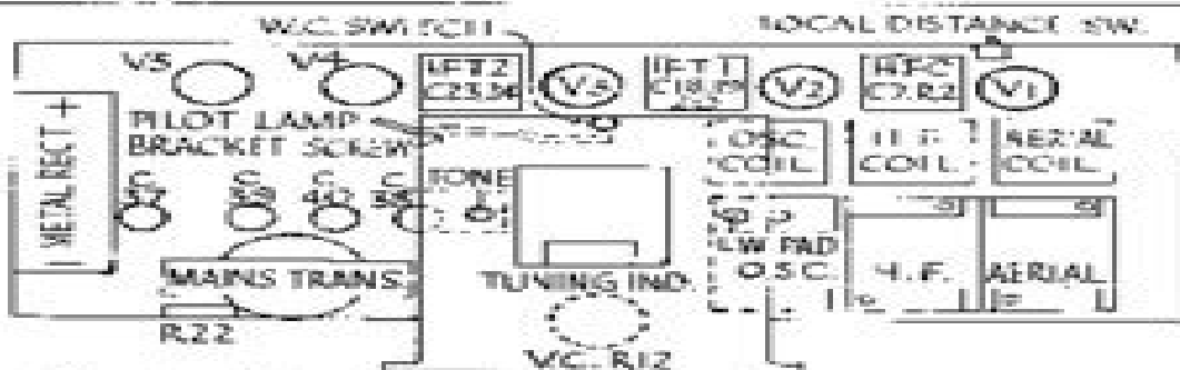
The position of the condenser and the screen controls are indicated in the plan of the 'Cambridge' chassis.