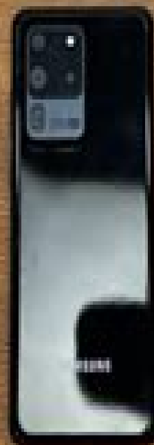
Galaxy S20 Ultra