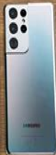
Galaxy S21 Ultra