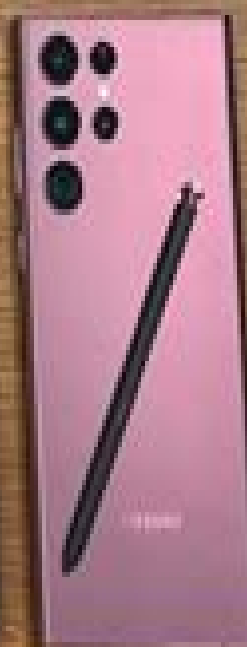
Galaxy S22 Ultra