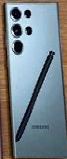
Galaxy S23 Ultra