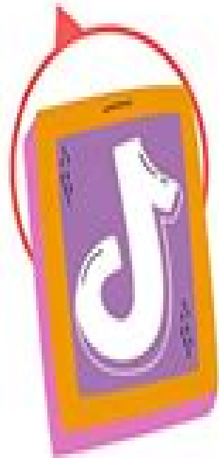
• The Monthly Active Users Of TikTok