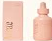
2. Arrae Digestion Duo