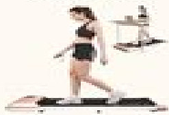
1. Superun Walking Pad