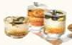
20. Art Deco Vintage Glasses