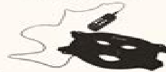
4. Bon Charge Red Light Face Mask