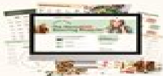
6. Digital Course