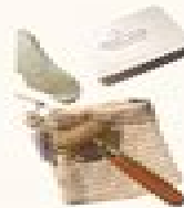
10. Primally Pures Plumping + Face Tools