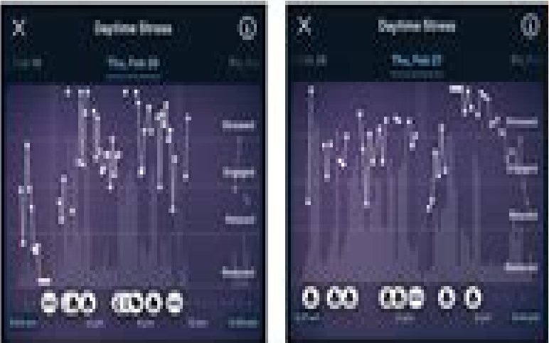
My Stress Levels Two Thursdays Before The Change