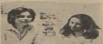
WOMEN WHO SUFFER FROM BATTERED PARTNERS often find it difficult to seek help. Support groups and counseling services are available, but many women are unaware of these resources.

The circle of silence surrounding battered women is a topic that has gained national attention in recent years. Many women who have suffered physical and emotional abuse at the hands of their partners find it difficult to seek help. The fear of retaliation, shame, and the financial dependence on their abusers often prevent them from leaving their homes. Support groups and counseling services are available, but many women are unaware of these resources. The community must continue to raise awareness and provide safe havens for these women.