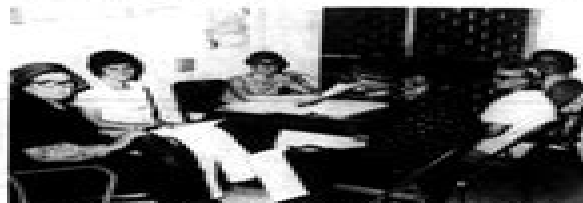
FROM THE FINAL PREPARATIONS —The Clarksville Chapter of the Homecoming Committee is busy preparing for the Homecoming activities. The committee is made up of students and faculty members who are responsible for the success of the Homecoming events. They are currently working on the decorations for the Friday night event.