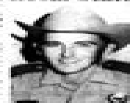
CLARKVILLE NATIVE —A Clarksville native is a local state trooper. He is a member of the Clarksville Chapter of the Homecoming Committee and is responsible for the success of the Homecoming activities. He is currently working on the decorations for the Friday night event.

The Clarksville native is a local state trooper. He is a member of the Clarksville Chapter of the Homecoming Committee and is responsible for the success of the Homecoming activities. He is currently working on the decorations for the Friday night event. The Homecoming activities are a major event in the community and are expected to draw a large crowd of visitors.