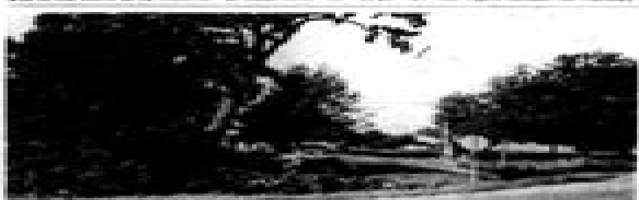
THE WOODLAND AREA —The Clarksville Chapter of the Homecoming Committee is sponsoring a number of events during the fair, including a parade and a dance. The committee is also responsible for the success of the Homecoming activities. They are currently working on the decorations for the Friday night event.

The Red Kap Open House is being held on Sunday, September 24, from 10 a.m. to 4 p.m. at the Red Kap store. The store is located at 1001 N. Main St. in Clarksville. The open house is a special event where customers can take advantage of a variety of discounts and special offers. The store is also offering a number of new items, including clothing, shoes, and accessories. The Red Kap store is a popular destination for shoppers in the Clarksville area.