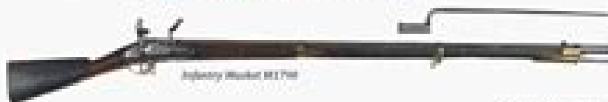
Infantry Musket M1798