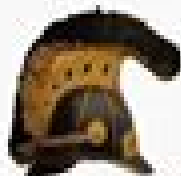
Infantry Officer 1793-1808