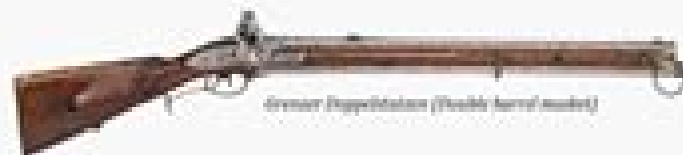
Grenadier Doppelstock (Double barrel musket)