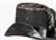
Paper Bonnet (Corsican hat)