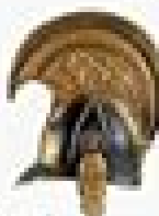
Cuirassier/Dragoon helmet (late war)