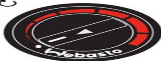
Heater Control Dial