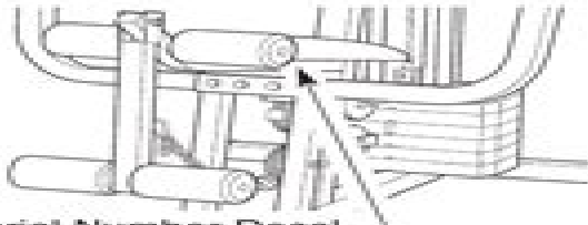
Serial Number Decal

(Write the serial number in the space above for reference.)