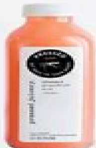
30 MIN BEFORE ALL-NATURAL COLD-PRESSED JUICE