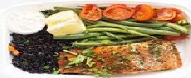
2-3 HOURS BEFORE GRILLED SALMON WITH VEGGIES & BLACK RICE