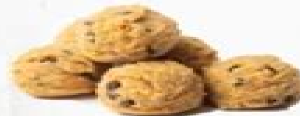
1-2 HOURS BEFORE CHOCOLATE CHIP PROTEIN BITES