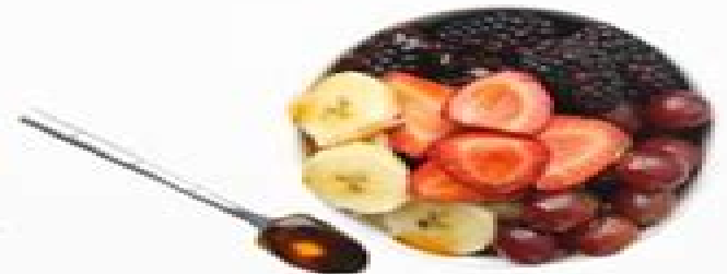
30 MIN BEFORE FRUIT BOWL DRIZZLED WITH HONEY