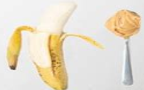
1-2 HOURS BEFORE BANANA WITH PEANUT BUTTER