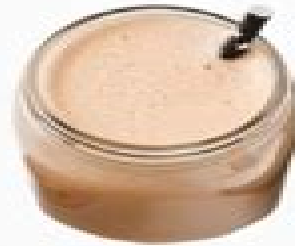
30 MIN BEFORE LOW FAT FRUIT SMOOTHIE OR PROTEIN SHAKE