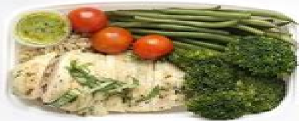
2-3 HOURS BEFORE PESTO CHICKEN WITH VEGGIES & BROWN RICE