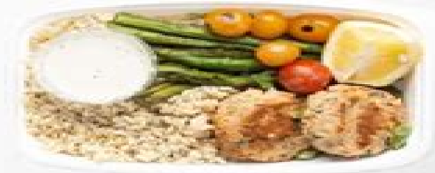
2-3 HOURS BEFORE SALMON CAKES WITH BROWN RICE