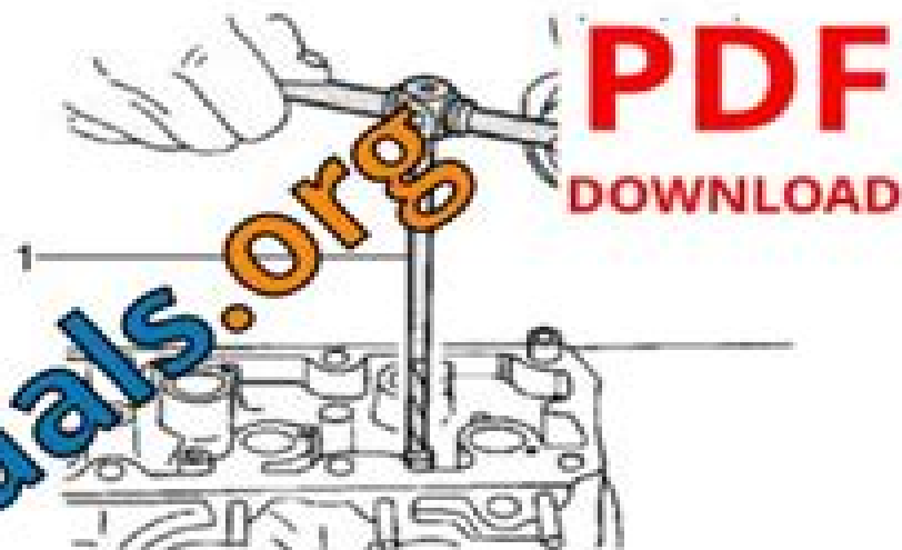
Fig. 62: Measuring Valve Guide Diameter Using KM-571-B

CAUTION: Refer to Safety Glasses Caution in Cautions and Notices.