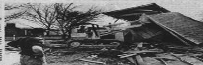
Damage to the Santa Anna Baptist Church, which was destroyed by a fire, is being repaired by the church members. The church is located on the corner of the intersection of the highway and the river.

The marker is located on the corner of the intersection of the highway and the river.