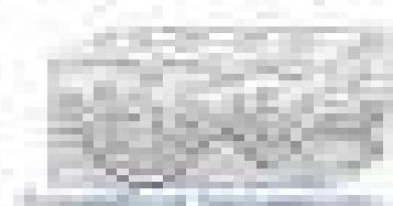
Loose Connective Tissue

Connective tissues are the following in the body: