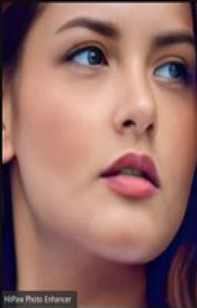
HiPaw Photo Enhancer