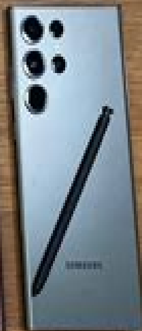
Galaxy S23 Ultra