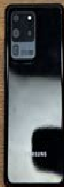
Galaxy S20 Ultra