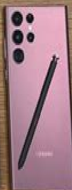
Galaxy S22 Ultra