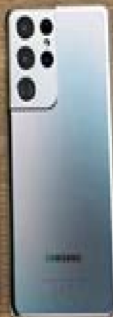
Galaxy S21 Ultra