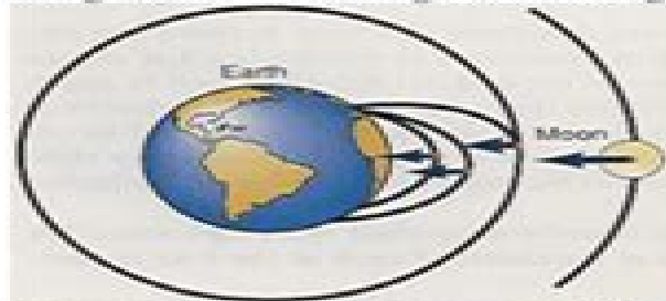
Figure 10.2 The same force acting on a projectile acts on the moon.

Newton's first law dictates, it is continually acted on by a force pulling it back to earth. If you were strong enough to throw the apple or any projectile with greater and greater initial velocities, then the projectile paths would be as shown in figure 10.2. The distance down range would become greater and greater until at some