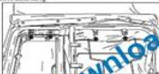
2. Trunk room view