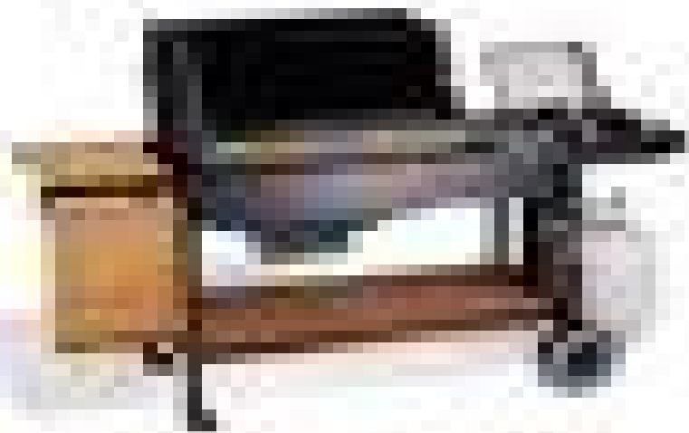
● Chair 1000-2000