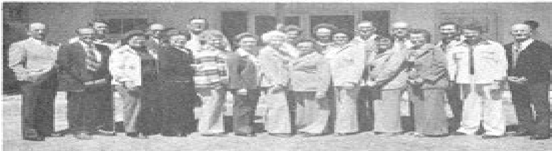
Financial Secretaries' and Treasurers' Group

A large group of SPJST Lodge officers participated in the Regional Workshop held at Hallettsville, March 18th, beginning at 10 a.m. A buffet lunch and refreshments were served at 12 noon to over 70 officers including a number of Supreme Lodge officers.