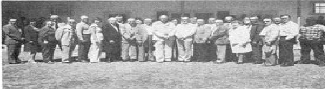
Presidents' and Vice Presidents' Group — Representing Districts V, VI and VII.