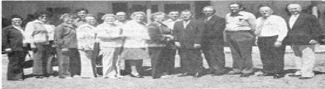
Secretaries at the Workshop