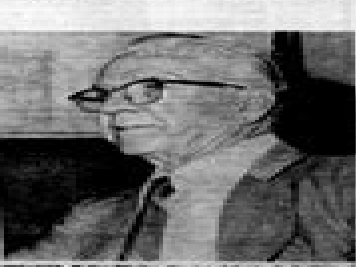
Mr. [Name], [Title], [Organization], [Address], [City], [State], [Zip].