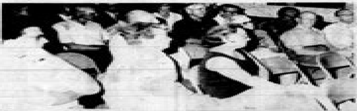
A group of people attending a [Event] at the [Location] on [Date].