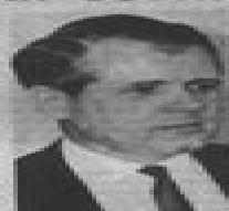
Respected artist slated to judge at Country Fair

A respected artist is slated to judge at the Country Fair. The artist is a well-known figure in the art world. The artist is a well-known figure in the art world. The artist is a well-known figure in the art world.