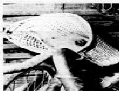
A person in a costume, possibly a Native American, holding a bow and arrow.

ATLANTA, Ga. (AP) — The Georgia State Museum director said today that the museum would not accept admission from the state of Georgia.