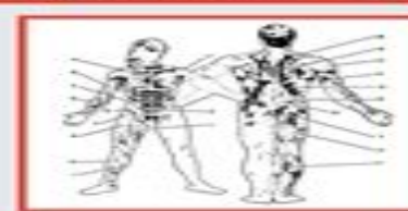
TABLE OF MUSCLES