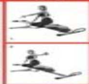
CROSSOVER PULL FEET UP