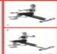
CROSSOVER PULL FEET DOWN