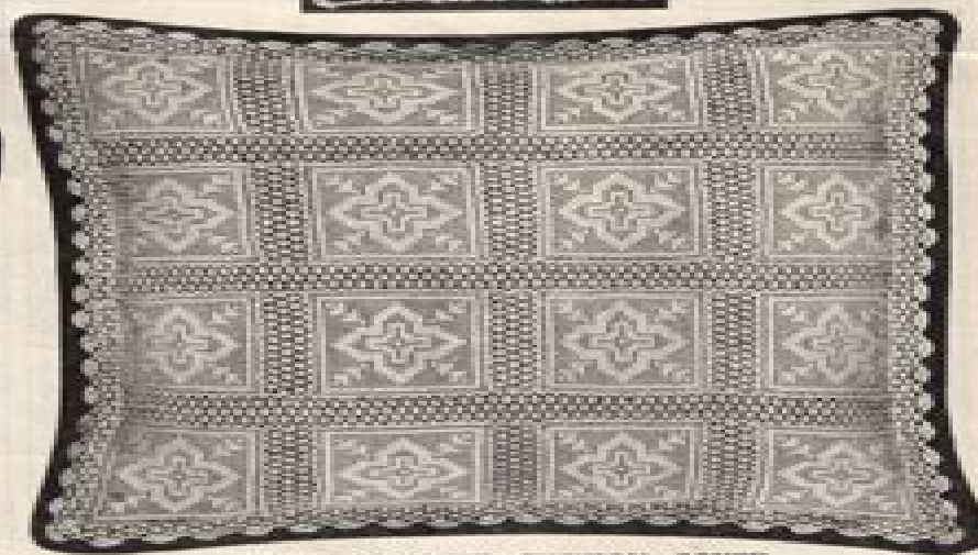
Fillet Crochet CUSHION COVER.

CAUTION. —The Illustrations and Letterpress in this Magazine are Copyright; the Publishers reserve all rights of Reproduction. WELDON'S, Ltd., Fashion Publishers, 30 to 32, Southampton St., Strand, London, W.C., and all Newsagents and Fancy Repositories.