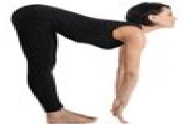
Standing Half Forward Bend