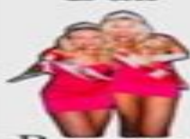
Prom queen Gone wrong