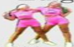
Bubble gum Bratz