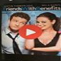
Friends with Benefits