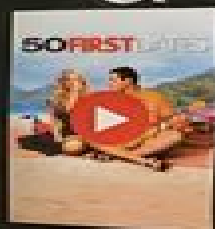
50 First Dates