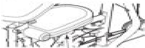
Serial Number Decal (under seat)

Write the serial number in the space above for future reference.