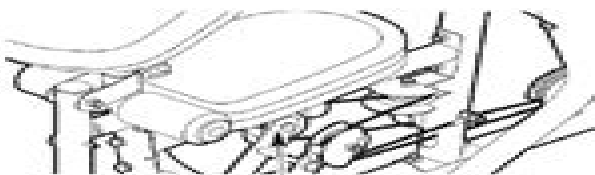
Serial Number Decal (under seat)

Write the serial number in the space above for future reference.