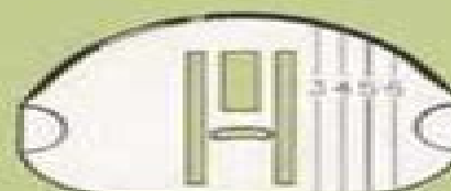
General Purpose Throat Plate