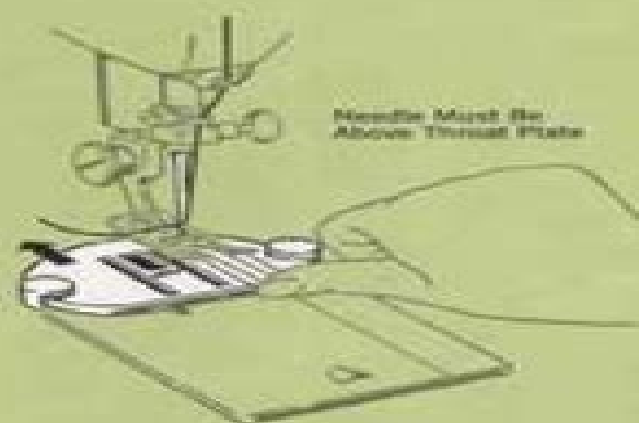
Removing Throat Plate