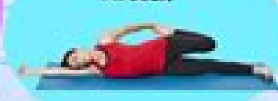
Laying Quad Stretch