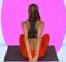
Seated Shoulder Squeeze