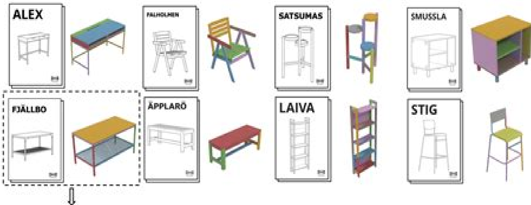
(b) Original Visual Manual