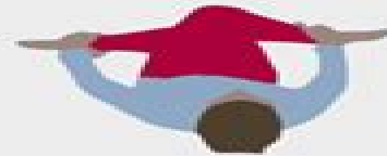
RECLINING COW FACE