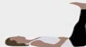
LEGS UP THE WALL