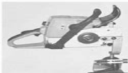
Chain saw on assembly stand

Servicing and repairs are made considerably easier if the saw is mounted on assembly stand 5910 850 3100 or 5910 890 3100. This enables the saw to be swivelled to the best position for the ongoing repair and leaves both hands free.