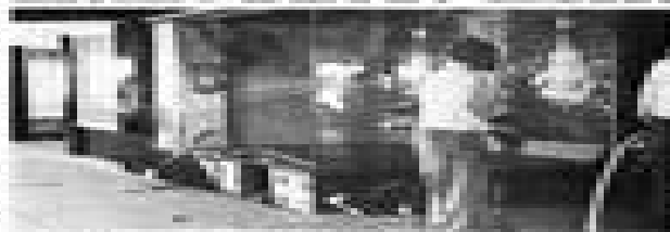
People waiting for a service or product.

District Court working on lengthy December docket. The court is currently working on a large number of cases that are scheduled for trial in December. The cases include a variety of civil and criminal matters. The court is working to ensure that all cases are heard in a timely manner and that the justice system is maintained. The court is also working to ensure that the cases are heard in a fair and impartial manner.