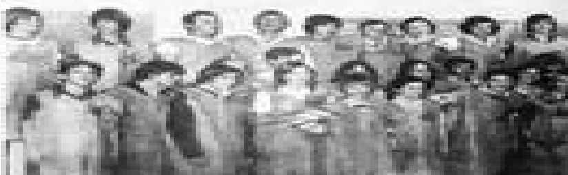
A group of people, possibly a choir or students, standing in rows.

Politician passes away, Smithville. A local politician has passed away after a long illness. The politician was a member of the local government and had been involved in many of the community's most important projects. The politician is survived by his family and friends. The community is in mourning and will hold a funeral service for the politician.