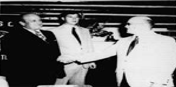
RECEIVING CONGRATULATIONS - [Name], [Name], and [Name] after the installation of the new Kiwanis Club officers.

The Delta County Probation Department has issued a summary of the probation cases for the month of September. The summary shows that there were a total of 150 probation cases filed during the month. Of these, 100 cases were completed and 50 cases are still pending. The summary also shows that the majority of the cases were for minor offenses, such as traffic violations and petty theft. The probation department is pleased with the results of the probation program and hopes to continue to provide a high level of service to the community.