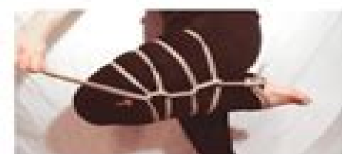
Step 10: reverse again, this time going over the thigh