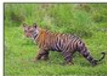
Amur tiger (Panthera tigris altaica) in a grassy field.