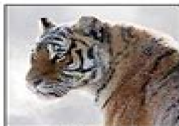
Amur tiger (Panthera tigris altaica) in a snowy landscape.