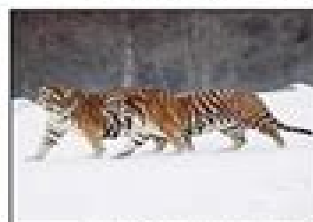
Amur tiger (Panthera tigris altaica) and its cub in a snowy landscape.