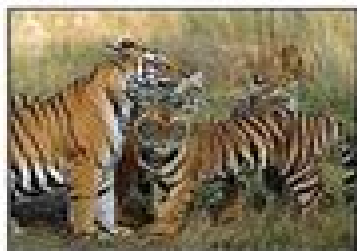
Amur tiger (Panthera tigris altaica) and its cub in a grassy field.