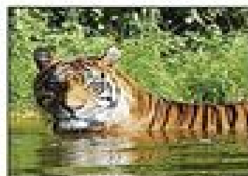
Amur tiger (Panthera tigris altaica) in a body of water.