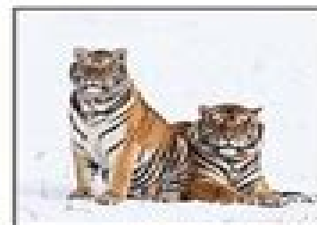
Amur tiger (Panthera tigris altaica) and its cub in a snowy landscape.