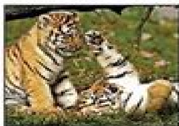
Amur tiger (Panthera tigris altaica) and its cub in a grassy field.