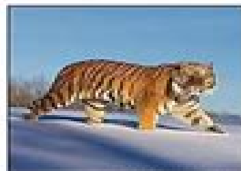
Amur tiger (Panthera tigris altaica) in a snowy landscape.