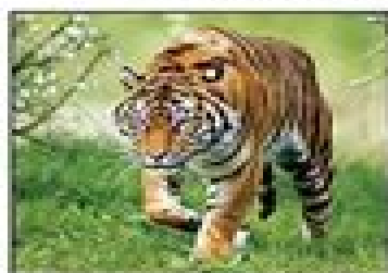
Amur tiger (Panthera tigris altaica) in a grassy field.