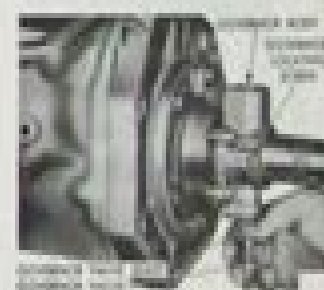
Fig. 4. Removal or Installation of Governor Valve and Shaft