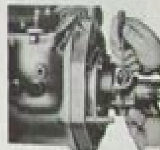
Fig. 3. Removal or Installation of Governor Valve Shaft Snap Ring