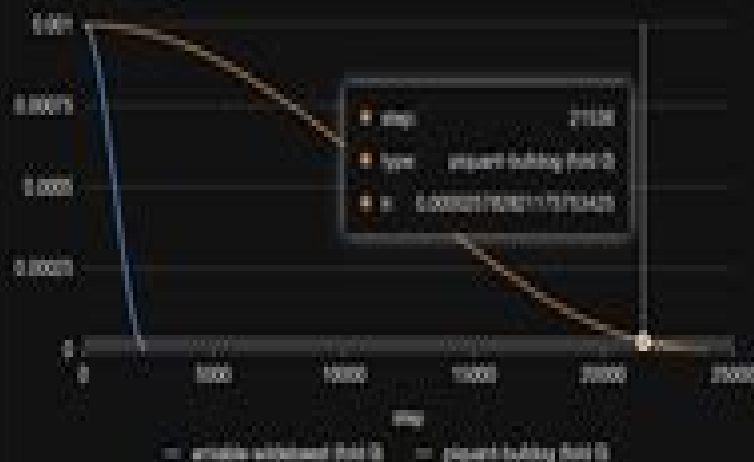
TRAIN BATCH LOSS