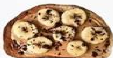
peanut butter, banana & shaved chocolate