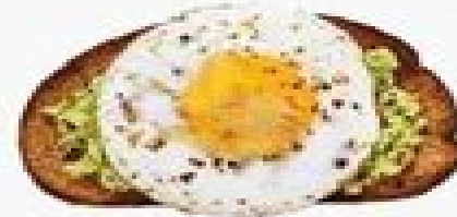
avocado, egg & chili flakes