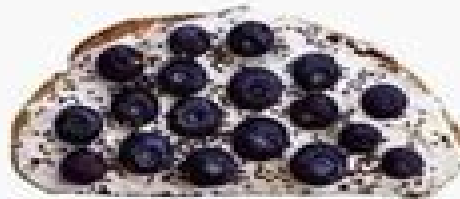
blueberries, greek yogurt & chia seeds