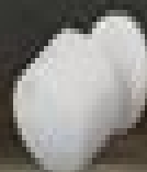
Presence Sensor FP300