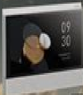
Panel Hub S1 Plus US