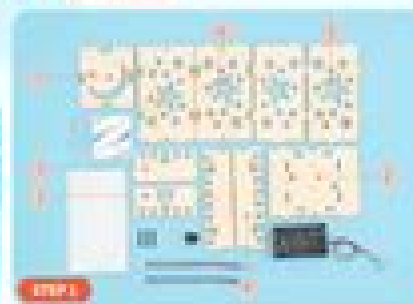
STEP 1 Prepare small production materials.